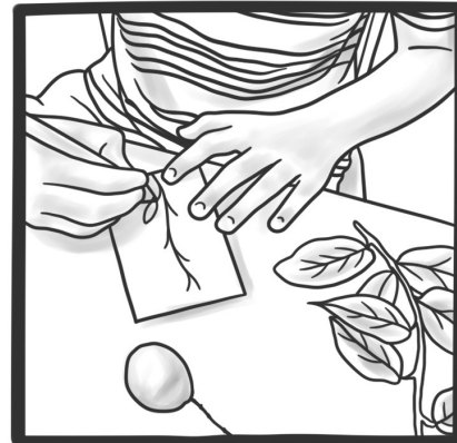
Handmade Accordion Books