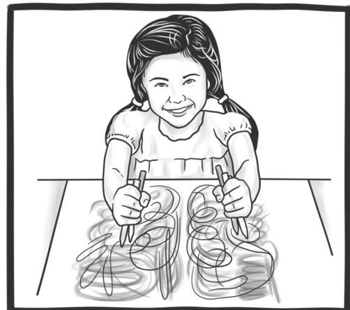
Double Doodling / Bilateral Scribbling